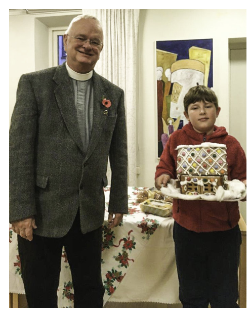
More dazzling pictures from the events of the day

It MAY HAVE BEEN gray and unpleasant outside but in the church people were happy and excited to celebrate our patron saint St Andrew whose picture watches over us from high up in the windows. It was a lovely service with the choir singing well with some extra voices.