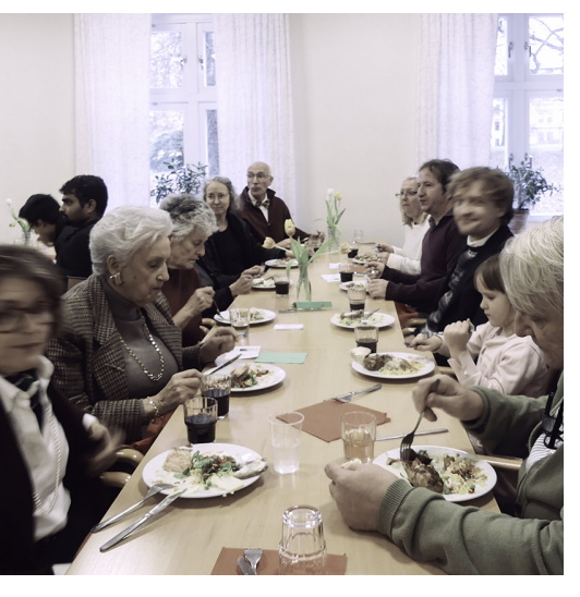
Everyone seemed to have a great time, both guests, helpers and entertainers