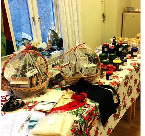
The Cnristmas Table with plenty of of wonderful iems to buy or win