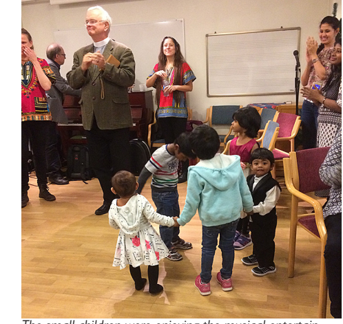
The small children were enjoying the musical entertainment