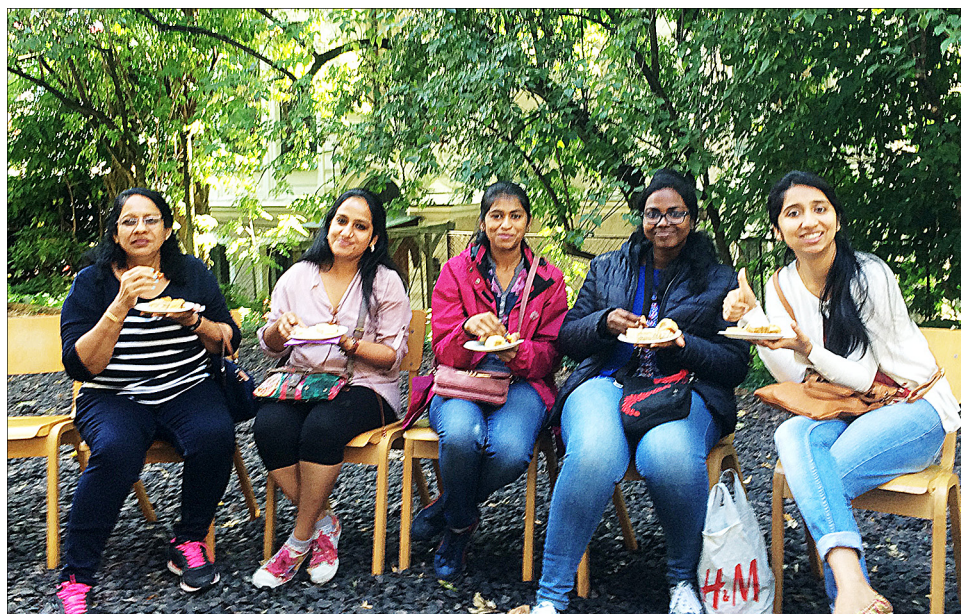
After the service there was a lunch provided by many members of the congregation