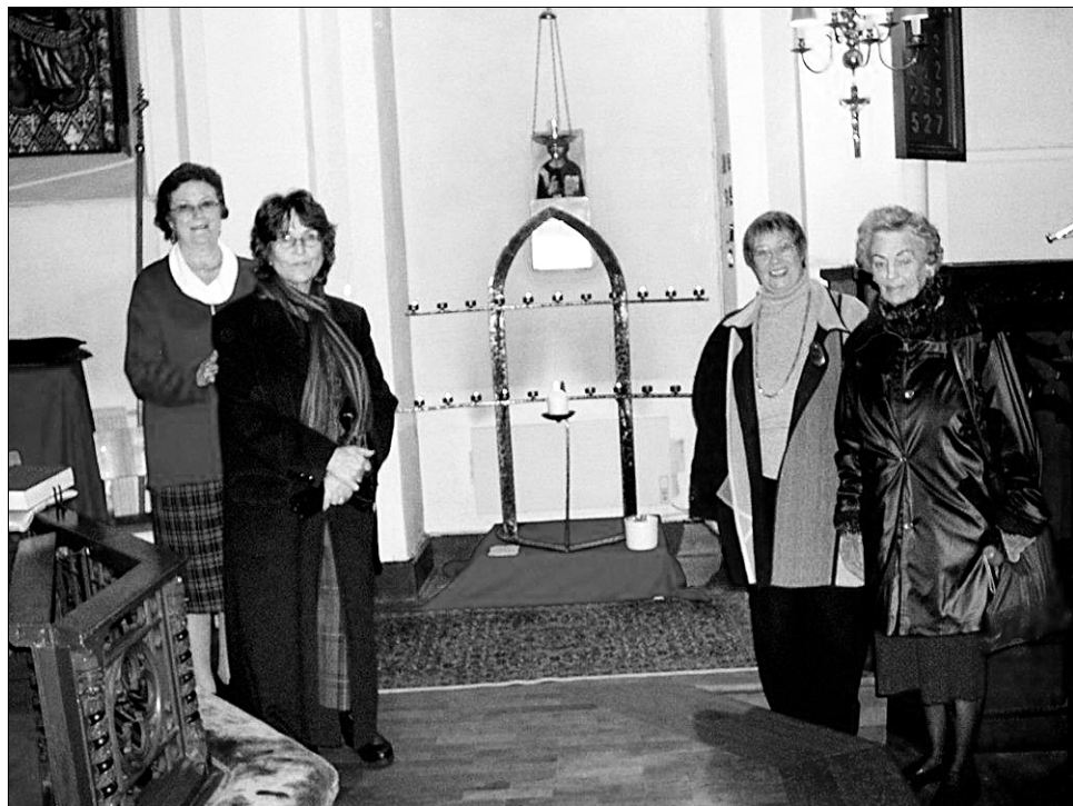
Guild donation of a votive candelstick to St Andrew's Church