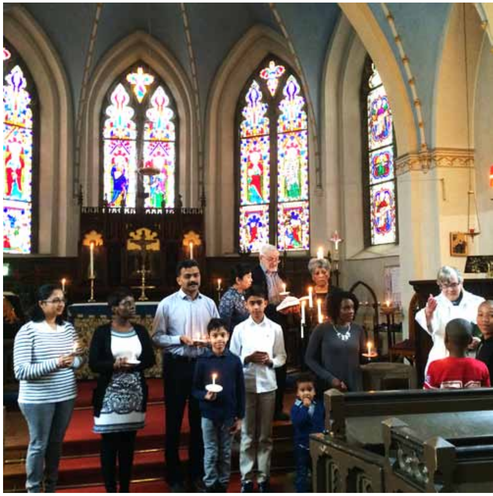
Candlemas with the procession and blessing of the candles