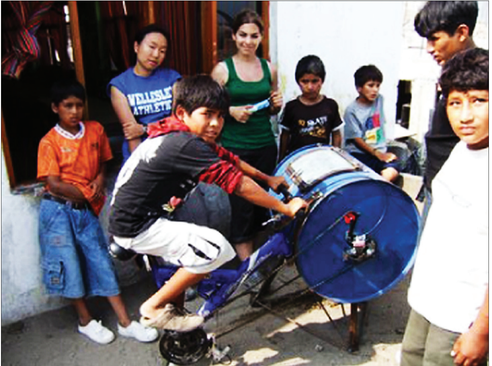
One of many bicycle-powered inventions

It would be possible to fill the whole of