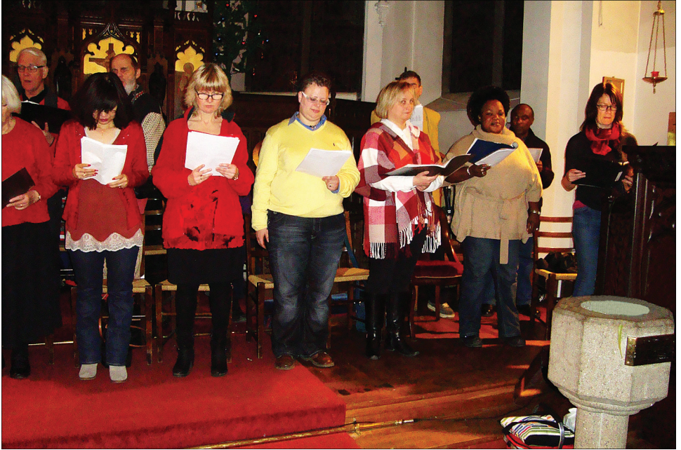
The choir at one of the two carol services