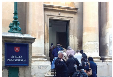
"St Paul Shipwrecked Church" and St Paul's Cathedral