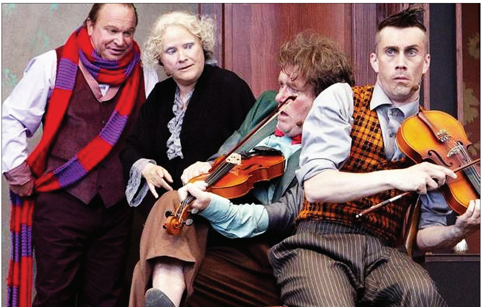
Scene from the play at Gunnebo