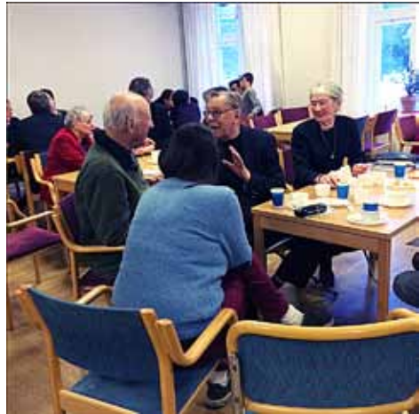
Some of the guests in deep conversation