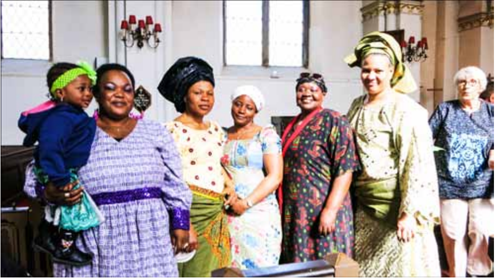
Many people came dressed up in their national costumes