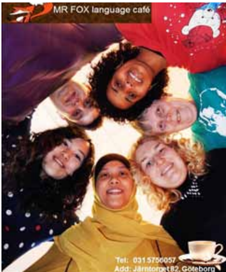
A poster produced as part of the coursework

ments can help or hinder constructive discussion and a sense of community.