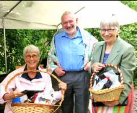
Three lucky lottery winners