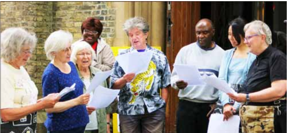
The Choir opened the Event with some lovely singing