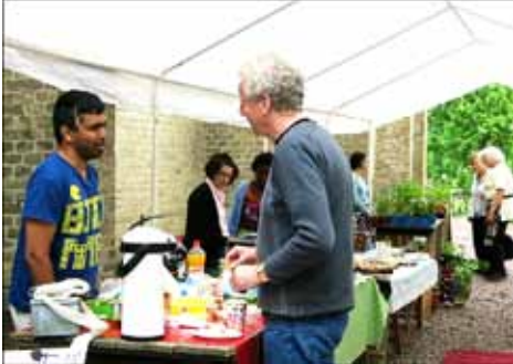
The refreshment team - the hub and mainstay of the event