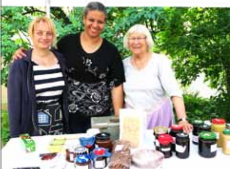
Cakes bread and marmalade for sale