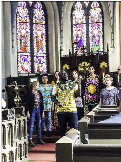
The African Choir Group singing for us