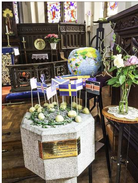
The flags of the nations present