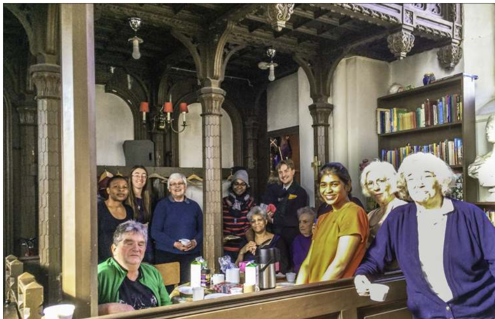
The Ladies Evening Group with a little additional help having a break during the cleaning session. The church has to be tidy for the Easter celebrations