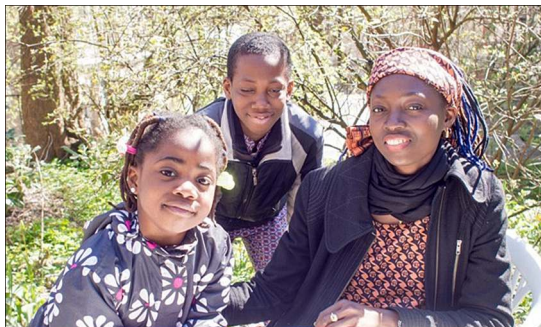
Some of the children gathered afterwards