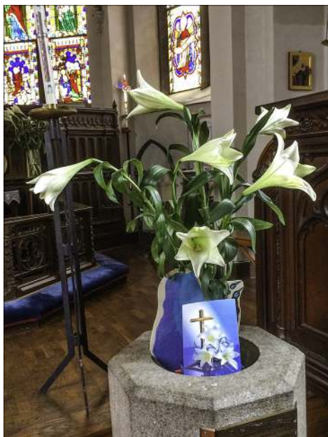
The Easter Lillies given by members of the congregation in memory of loved ones departed