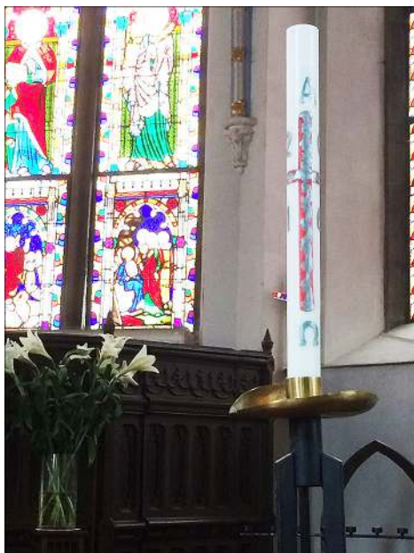
The Easter candle is lighted for the first time on Easter Day. It was handpainted by Gillian Thylander